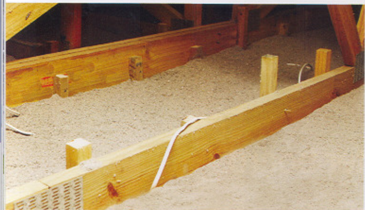
The user-friendly product is pumped into a ceiling by qualified sub-contractors.

At the recent GBCSA (Green Building Council of South Africa) Annual Convention, held in Cape Town, South Africa's Green Building Council announced significant progress in rolling out a Green Star Multi-Unit Residential rating tool, (scheduled for year-end in pilot form), and progress towards the Existing Buildings rating tool. The Existing Buildings tool is dependent on the adoption of a national energy benchmarking system as a first step.