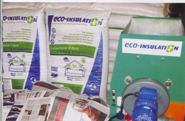
Cellulose insulation that is made from recycled newsprint is environmentally friendly and biodegradable.

With the release of the Green Building Council of South Africa's certification for sustainable buildings, a number of progressive developers and architects are designing more sustainable buildings or even gunning for a Green Star Rating. Materials consumed or used in the building process is one of nine major categories of evaluation, hence increasing relevance for green building materials. Other significant categories, related directly or indirectly to the performance of materials, include emissions and energy.