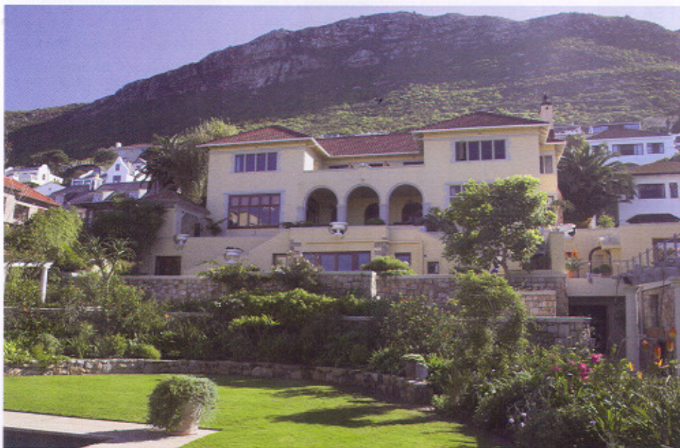
Rodwell House in St James, Cape Town, where Eco-Insulation was installed to stabilise demand for heating and cooling.

Rodwell House is an upmarket guesthouse in St James, Cape Town. Being close to the sea and east facing, the building receives an early morning dose of sun but goes into the shade by early afternoon when the sun slips behind the Kalk Bay mountains that form part of the Silvermine section of Table Mountain National Park.