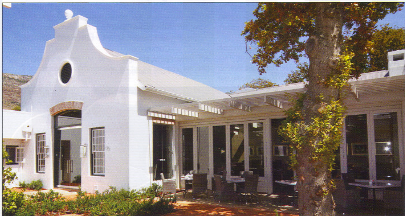
Environmentally-conscious insulation products were the natural choice for the renovation of an historically-sensitive project such as Catharina's

Architects, designers and other built environment professionals who want further information about the performance and sustainability benefits of using Eco-Insulation should consult the specifying databases, Specifile, Autospec, or visit the website www.eco-insulation.co.za .